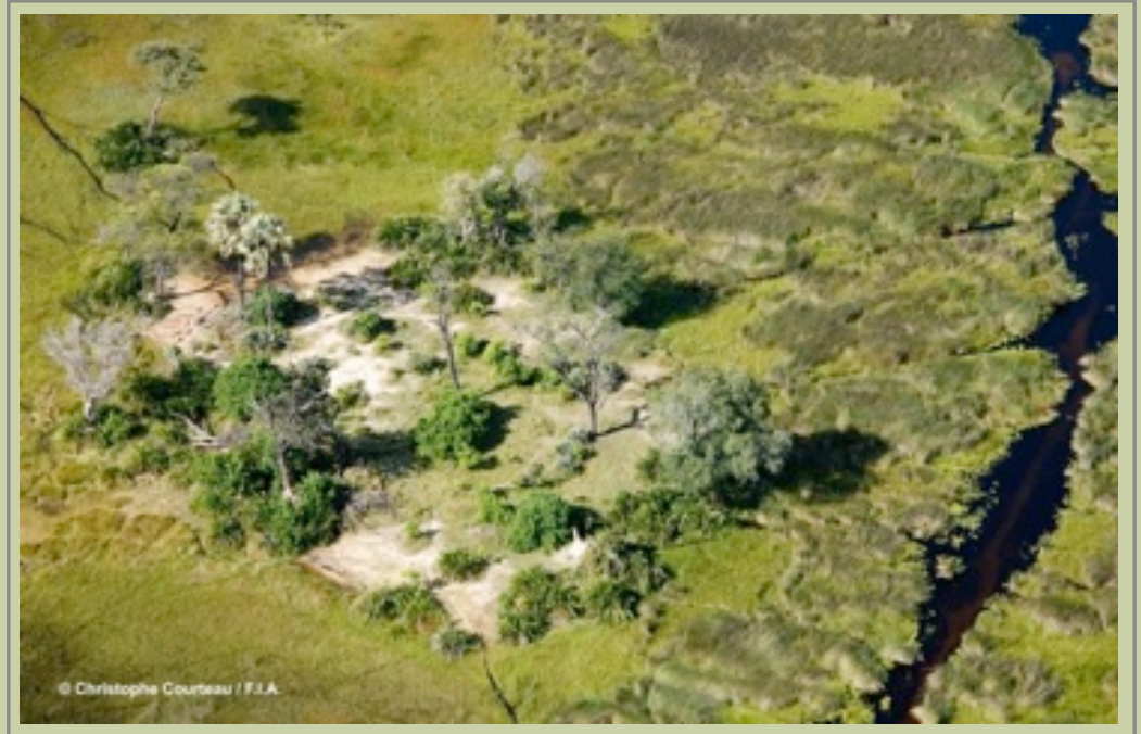
FOOTSTEPS IN AFRICA - BOTSWANA MADE EASY & AFFORDABLE