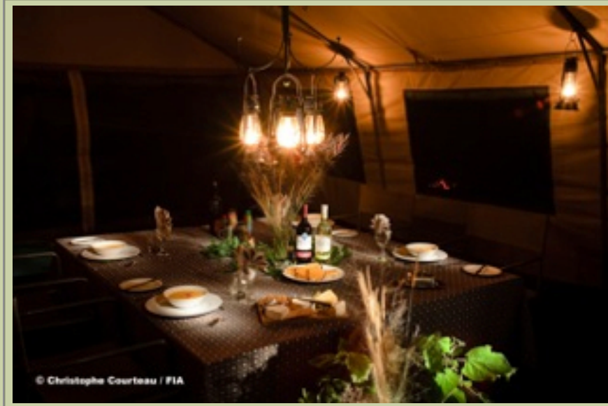
Main Complex - Interior