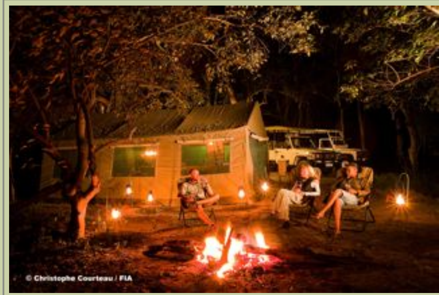
Main Complex - View