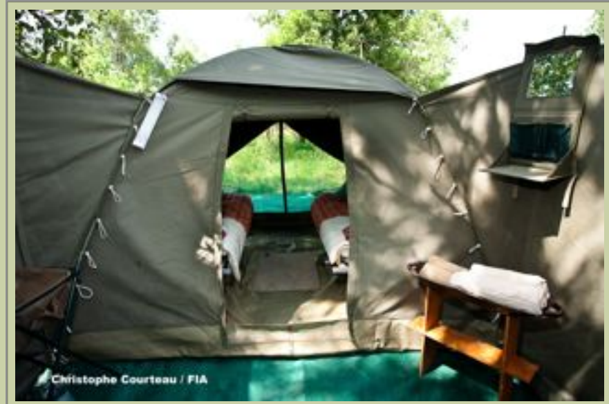
Tent - Bathroom