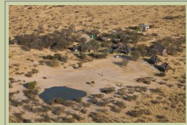
Arial View of Lodge