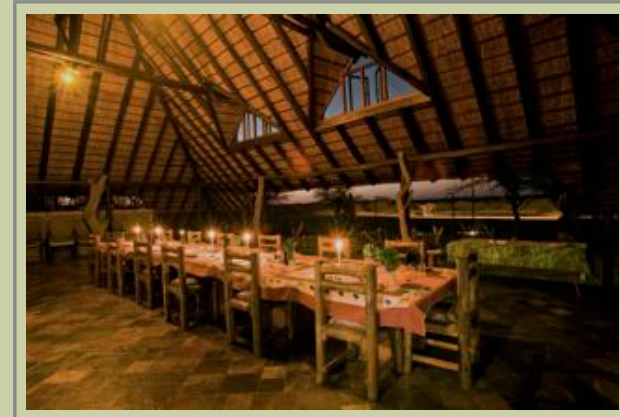
Main Complex - Interior