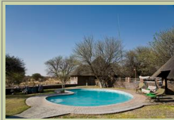
Main Complex - Pool area