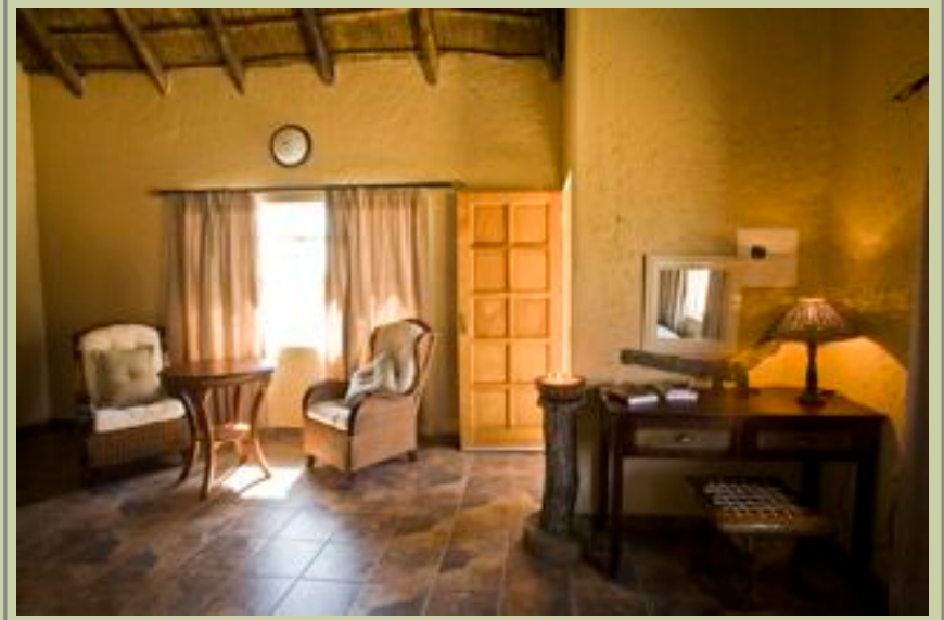
Suite - Lounge