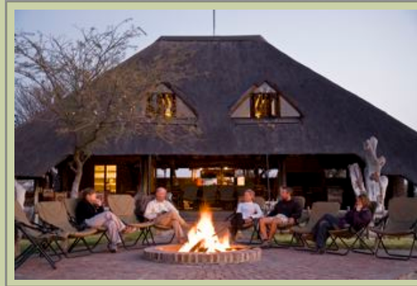
Main Complex - Exterior

Self-drive access is possible, although a 4 X 4 vehicle is required to reach the lodge. Alternatively guests traveling in a sedan vehicle can be collected by the lodge staff in Ghanzi (where secure parking is available) and transferred to the lodge.