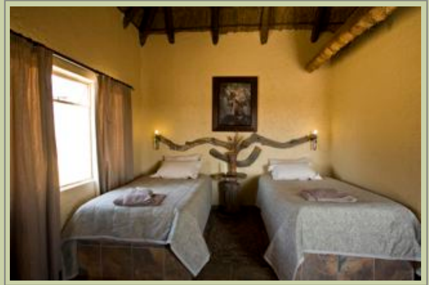
Suite - Bedroom

The San (Bushman) activities, and the seventh- generation family of owners, with a wealth of knowledge and history in the Kalahari.