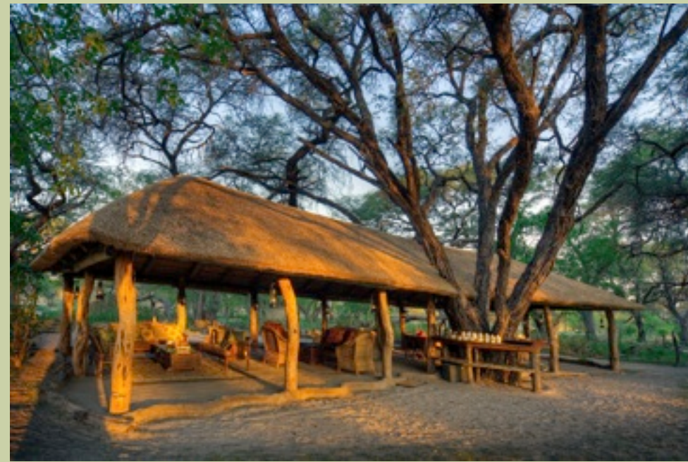
Main Complex - Exterior