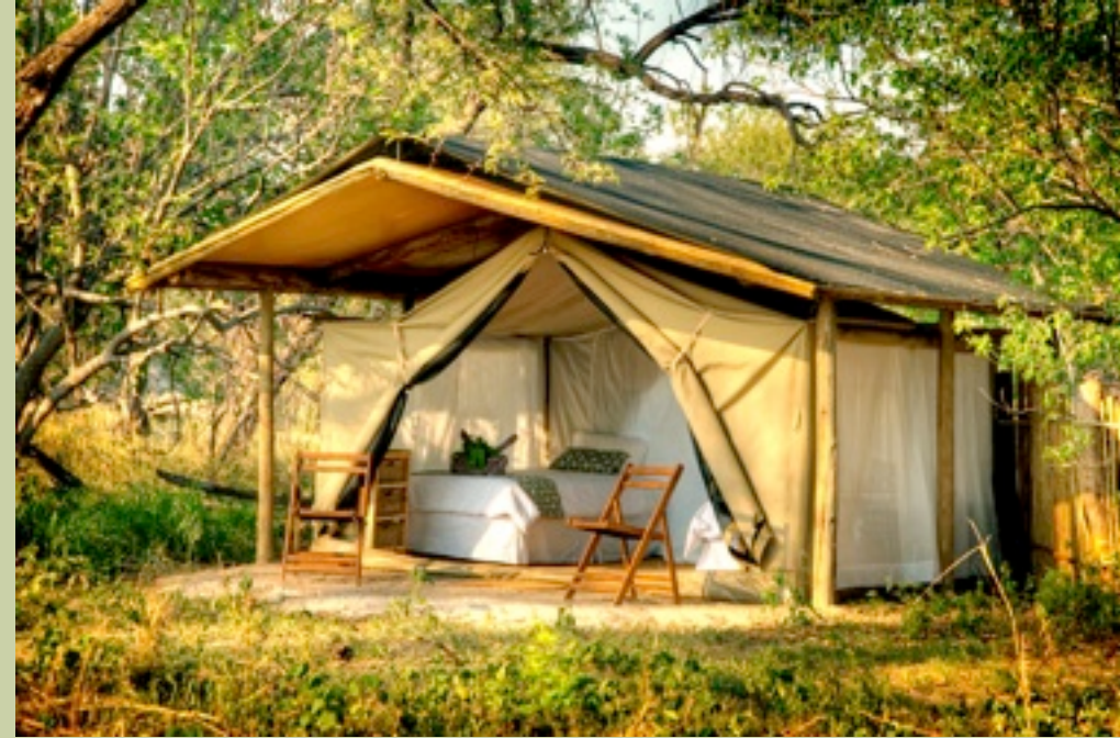
Tent - Exterior

Rates are offered on a fully inclusive basis.