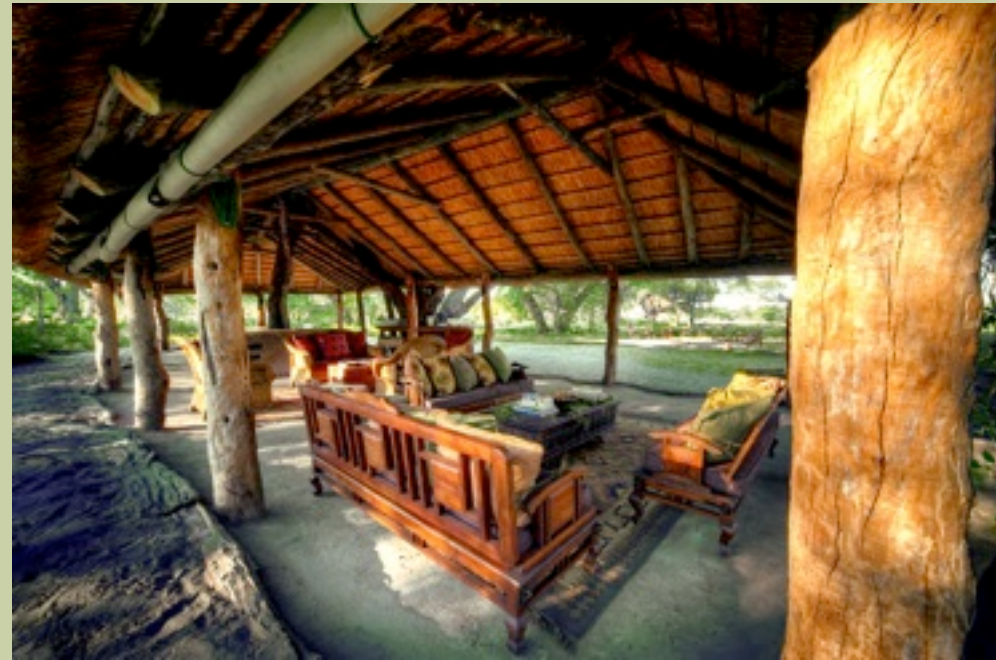
Main Complex - Interior