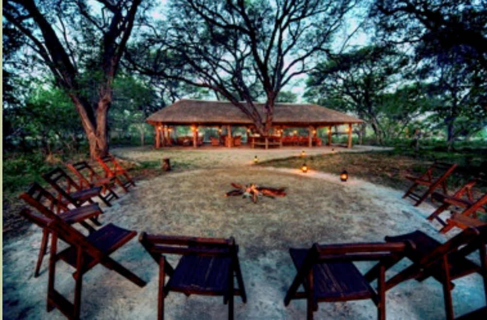
Main Complex - Exterior