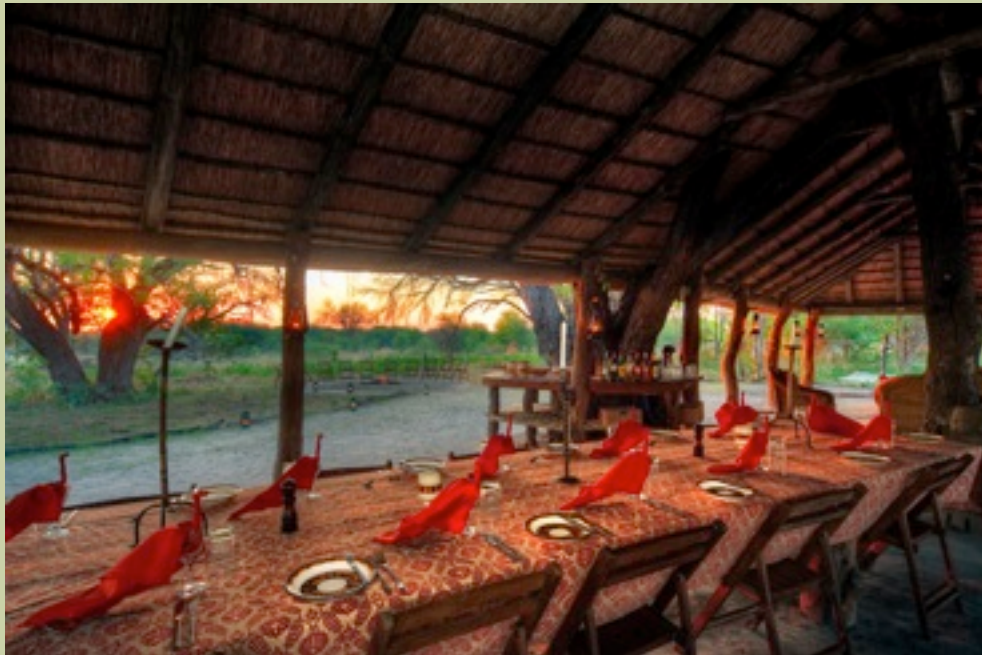
Main Complex - Dining area