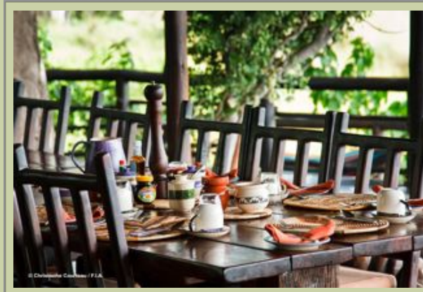
Main Complex - Dining area