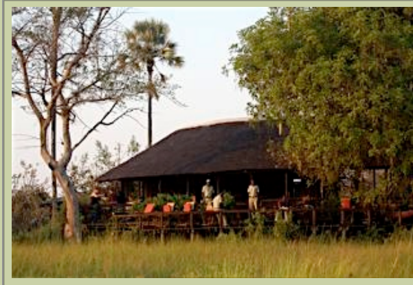
Main Complex - Exterior

The amazing design of the Chalets is such that you enjoy the luxuries of a 'top rate' hotel, but without affecting the environment; you will find you share your chalet with the trees, while taking full advantage of the views of the surrounding bush and flood-plains.