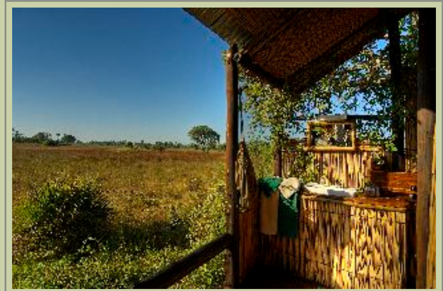
Suite - Bathroom