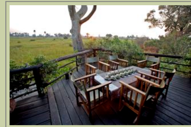
Main Complex - Tea Deck