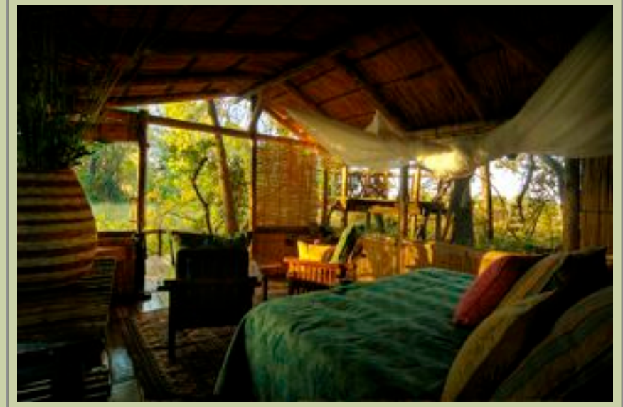
Suite - Bedroom

RATES: Rates are Fully Inclusive of local brand drinks and all activities.