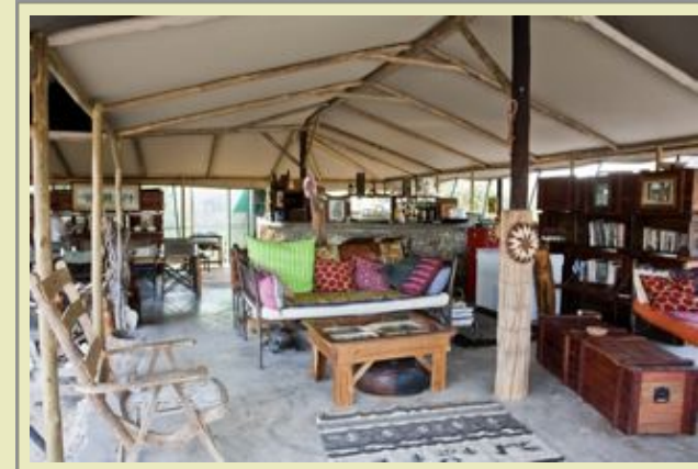
Main Complex - Interior