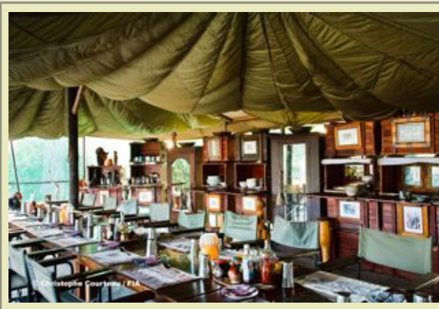
Main Complex - Dining area