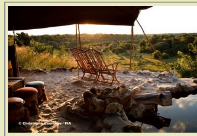
Main Complex - Pool Area