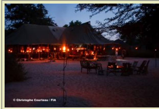
Main Complex - Exterior

Canvas shelter viewing areas around the ‘natural’ rock pool offer a unique vantage point above the riverbed, an ‘up close’ viewing hide brings guests closer to the wildlife activity.