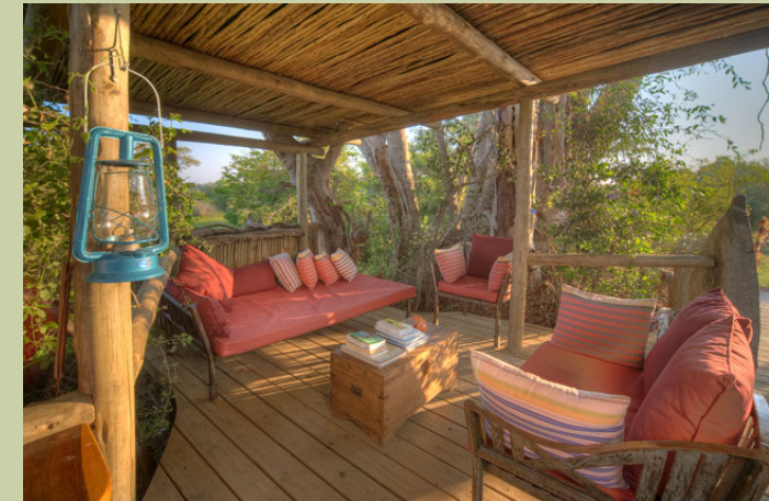
Main Complex - Lounge