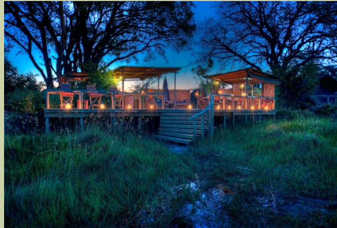
Main Complex - Exterior

It might also be possible to visit his village, meet the elders and perhaps his family. Subject to water levels, it is also possible to go camping.