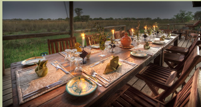
Main Complex - Dining area