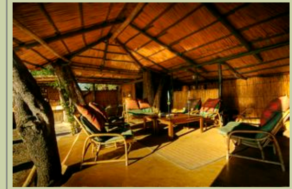
Main Complex - Interior