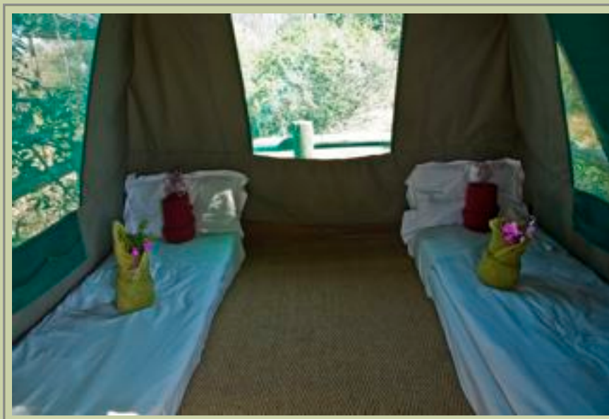
Tent - Interior

Camping equipment is provided, though it is suggested that you bring your own sleeping bag.